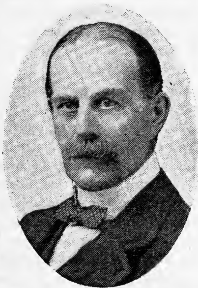
MARQUIS OF CREWE, K.G.

lieutenants of Lord himself seen much Tirah Expedition African Campaign, War he served Division of the tionary Force in Marne to Ypres of having won promo- was at the begin- brought in to quarters to be head Section of the subsequently was portant responsi- of Military Opera- perial General